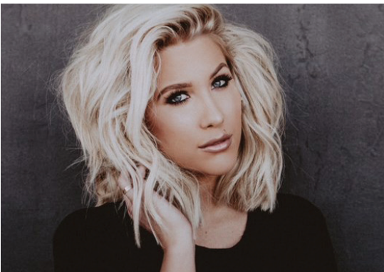
SAVANNAH CHRISLEY from chrisley knows best

MARCH 1-3 at the agricenter ..... tickets $12 at door, $6 for kids ..... friday 10a-8p sat 10a-7p sun 11a-5p SAVOR. SHOP. SHARE THE FUN : show specials : celebrities : live entertainment